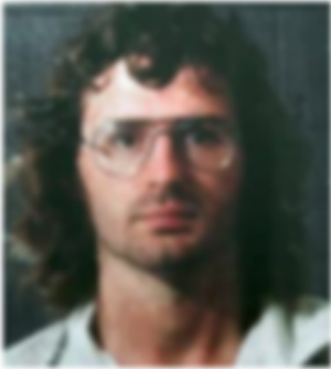
Branch Davidian leader David Koresh in a police line-up following a 1987 gunbattle between Davidians.

FBI profilers warn in a memo that increasing tactical pressure "could eventually be counterproductive and could result in loss of life."