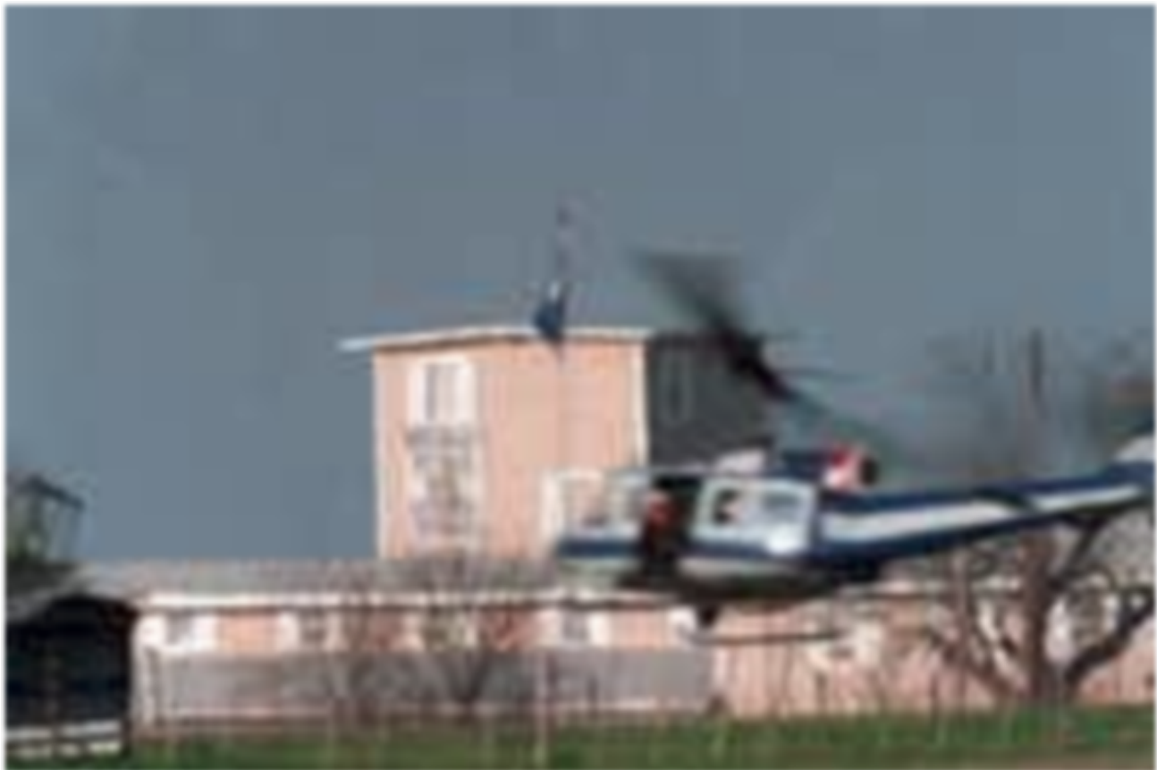
A helicopter buzzes past the compound on March 27. A new sign was draped out the tower window which read "Rodney King we understand."