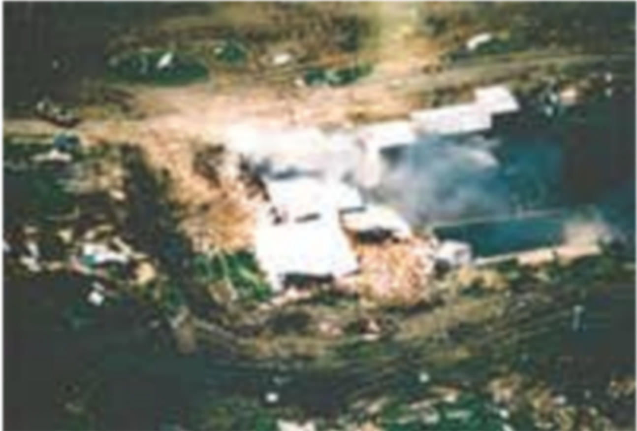
A photo taken from an FBI aircraft just after noon on April 19 as fire first broke out in the compound.

Asked about progress on Koresh's manuscript, Schneider tells a negotiator he hasn't seen anything.