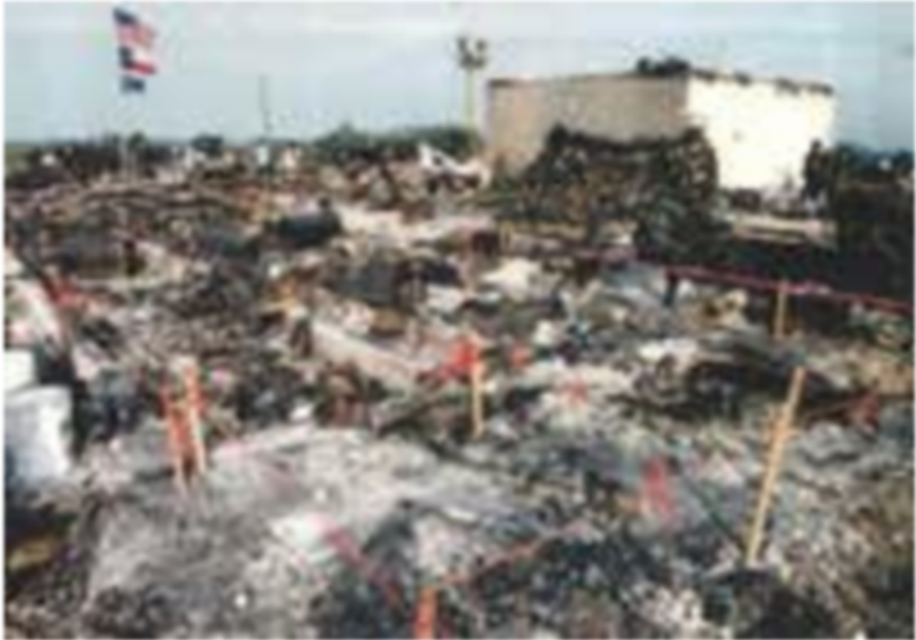
A government photo of U.S., Texas, and AFT flags which law enforcement raised over the charred rubble of the Branch Davidian compound after the standoff and siege resulted in the fire that killed more than 70 people.