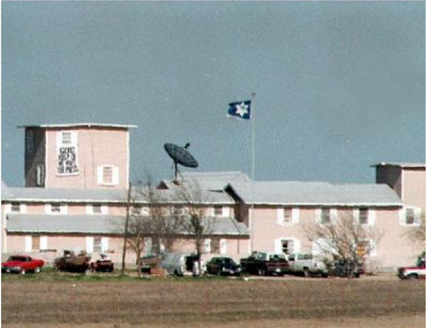
The Sinful Messiah: The law watches, but has done little