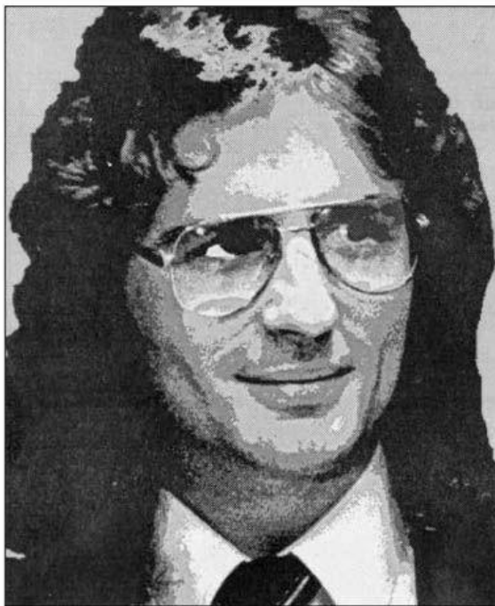
Vernon Howell, 33, is the leader of a Waco-based cult called the Branch Davidians. His followers consider him Christ.

Authorities have not acted on the complaints. For various reasons. Some officials said former cult members making the allegations have not appeared in person to swear out a complaint against Howell, though they have mailed sworn statements to local, state and federal authorities. Other officials said they needed evidence, not allegations.