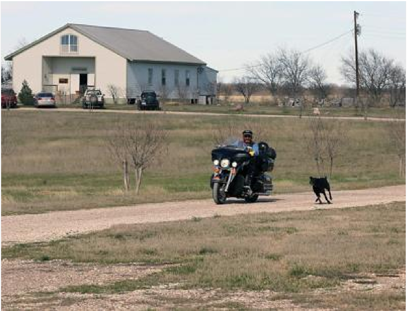
The Sinful Messiah: Experts — Branch Davidians dangerous, destructive cult